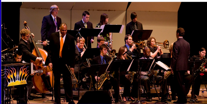
40th Annual SWOSU Jazz Festival